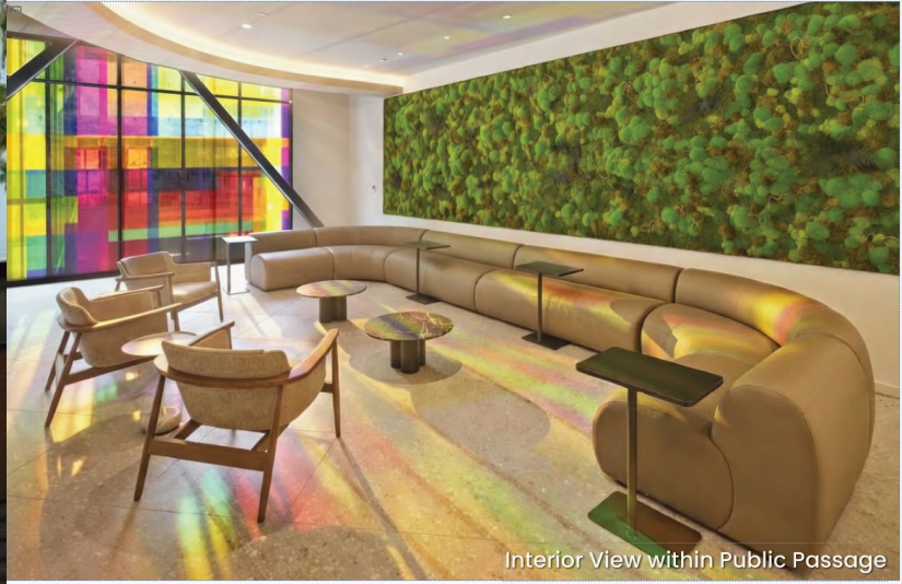
Interior View within Public Passage